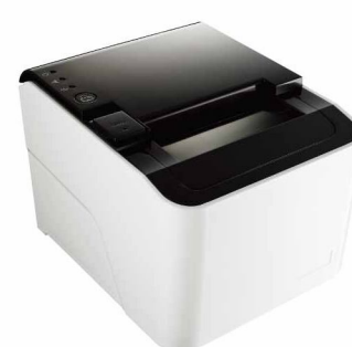
PRP-250 Glossy Thermal Receipt Printer