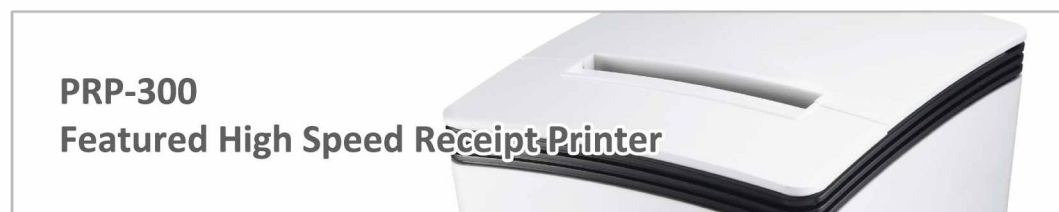
PRP-300 Featured High Speed Receipt Printer

Fametech Inc. provides customers with wide variety of printers and welcomes OEM/ODM orders. We are able to prototype your desired specifications and eventually deliver high-quality printers in a reasonably short period of time. Custom logos, instructions and packages are all available upon request.