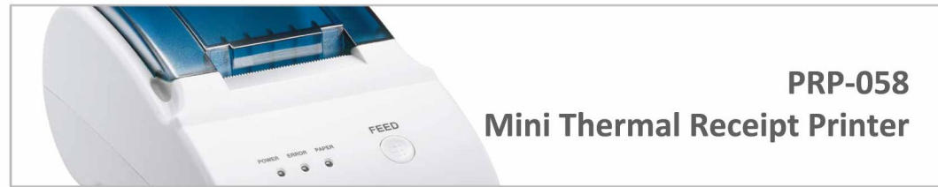
PRP-058 Mini Thermal Receipt Printer