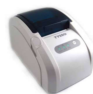
PRP-058C Compact Thermal Receipt Printer