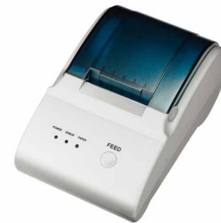
PRP-058 Mini Thermal Receipt Printer

* The alarm buzzer PBZ-100 is released, please visit our website for more information.