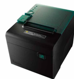
PRP-188 Vertical Thermal Receipt Printer