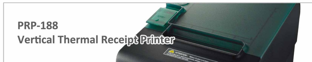
PRP-188 Vertical Thermal Receipt Printer