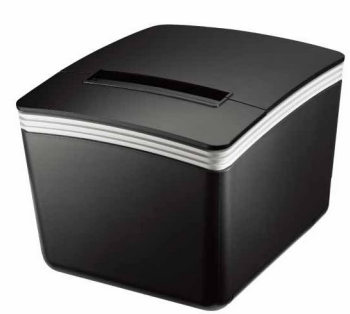
PRP-300 Featured High Speed Receipt Printer