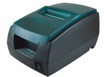
PRP-076 Dot-Matrix Receipt Printer