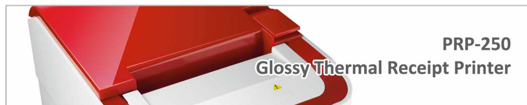
PRP-250 Glossy Thermal Receipt Printer