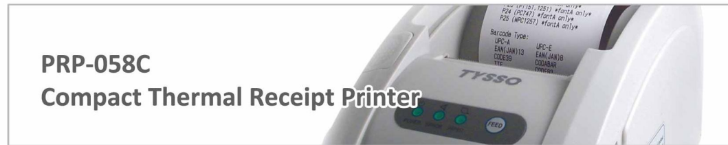
PRP-058C Compact Thermal Receipt Printer